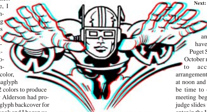
The 3-D Superhero "Stereon" from Battle for a Three Dimensional World (1982)

At the same time, I was producing 3-D conversions for coloring books, toys and games and advertisements in the form of 3-D posters and magazine inserts. One of the innovations that always interested me was full-color, or "polychromatic" anaglyph using more than just 2 colors to produce the 3-D image. Tony Alderson had produced a full-color anaglyph backcover for the Kirby 3-D comic book and I began using the process in 1985 with three "Deluxe Playsets" for the Colorforms company featuring licensed properties such as "Golden Girl," "Thundercats," and "The Muppet Babies."